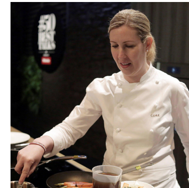
Clare Smyth first female British chef to hold and retain three Michelin stars, apprentice at Grayshott Hall

In today's highly competitive job market it is really important that you not only gain relevant qualifications but you also develop the skills and abilities that employers are looking for.