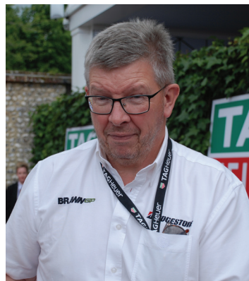
Ross Brawn Formula 1 managing director of Motorsports, mechanical craft apprentice for UK Atomic Energy Authority