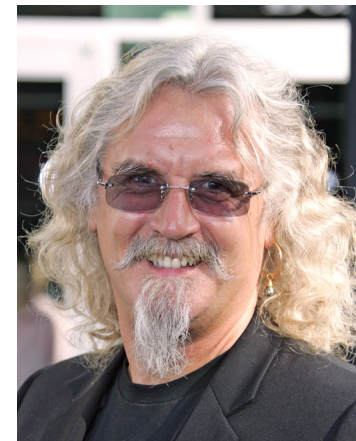
Billy Connolly comedian Welding apprentice

In today's highly competitive job market it is really important that you not only gain relevant qualifications but you also develop the skills and abilities that employers are looking for.