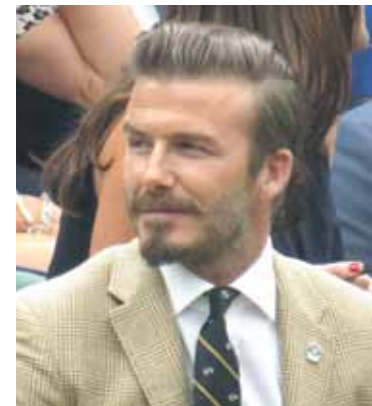
David Beckham footballer apprentice Manchester United

Apprenticeships are a great way to gain valuable workplace experience whilst still studying the processes and skills of your chosen area in more detail.