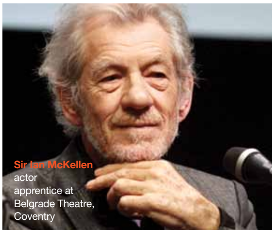
Sir Ian McKellen actor apprentice at Belgrade Theatre, Coventry

You have so many choices when it comes to choosing a career and how you pursue that career. School? Sixth Form? College? Work? It is important that you seize the opportunity to consider all the options open to you and make up your own mind as to what works best for you.