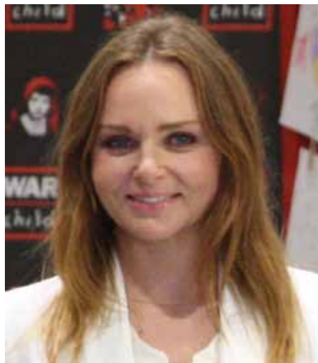
Stella McCartney fashion designer apprentice to Savile Row tailor