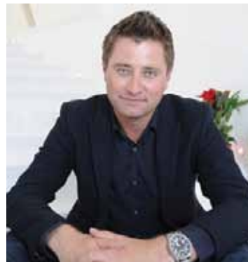
George Clarke TV architect and presenter apprentice in Architecture