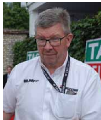
Ross Brawn Formula 1 managing director of Motorsports, mechanical craft apprentice for UK Atomic Energy Authority

In today's highly competitive job market it is really important that you not only gain relevant qualifications but you also develop the skills and abilities that employers are looking for.