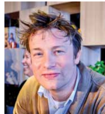
Jamie Oliver chef catering apprentice

In today's highly competitive job market it is really important that you not only gain relevant qualifications but you also develop the skills and abilities that employers are looking for.